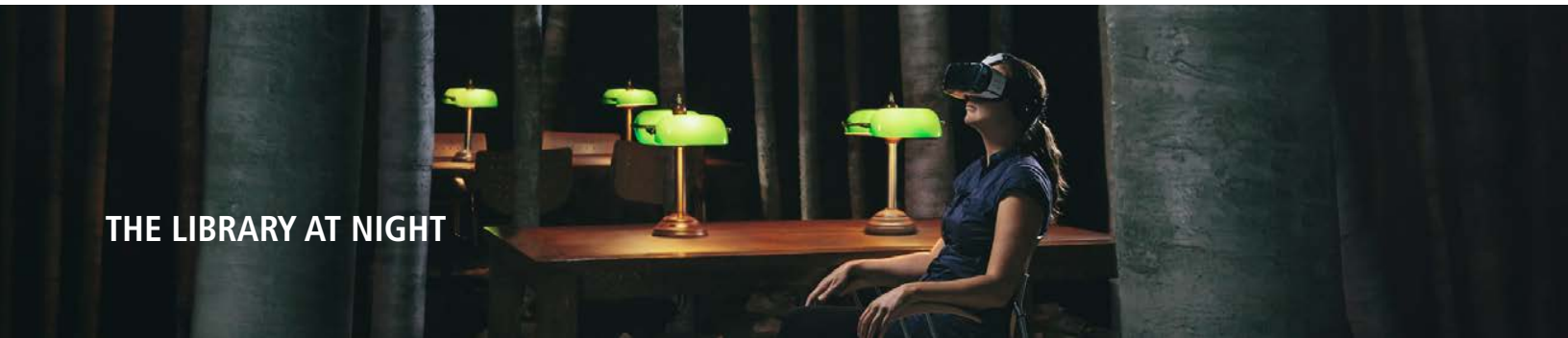
THE LIBRARY AT NIGHT

K nown for his high tech productions in opera, theatre, circus and large scale projections, Robert Lepage prefaces his comments by insisting he knows nothing about how technology works. This, he says, is fine as it allows for a more poetic point of view. “Artistically, I don’t get involved in the technical aspects ... it’s another language and I trust the people who do it, and they do it well.” For the next hour, as he expands upon the intersection of art and technology, it becomes very clear that what makes his work so powerful is that technology is in the service of art. So much so, that it has to race to catch up with the artistic vision.